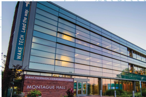
Southern Wake Campus 9101 Fayetteville Road Raleigh, NC 27603 919-866-5000