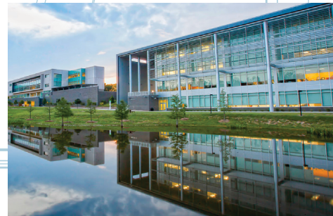
Scott Northern Wake Campus 6600 Louisburg Road Raleigh, NC 27616 919-532-5502